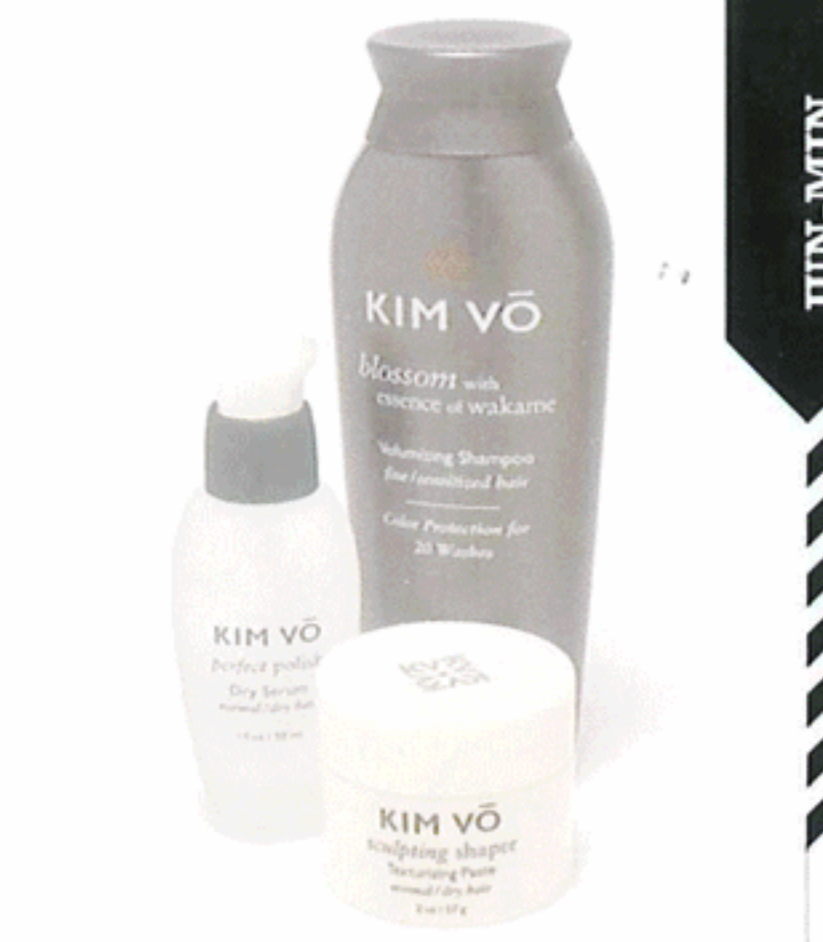
Kim Vo Perfect Polish, $55, Sculpting Shaper, $23, and Volumizing Shampoo, $22, Barneys New York.